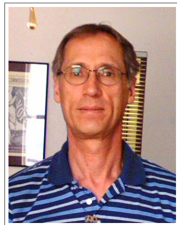
Health Education Specialist, Insiders Program, Community Health Department